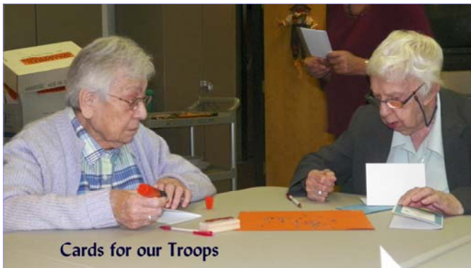
Cards for our Troops

We also had a night time activity dipping delicious treats in chocolate. Many participated in this activity and it was quite satisfying for me to see how happy they were enjoying this activity and the fun the sisters had with each other. I also invited anyone who would enjoy being taste testers. The next day we had a large tray of awesome goodness for everyone to try. It was the talk of the day!! We also created